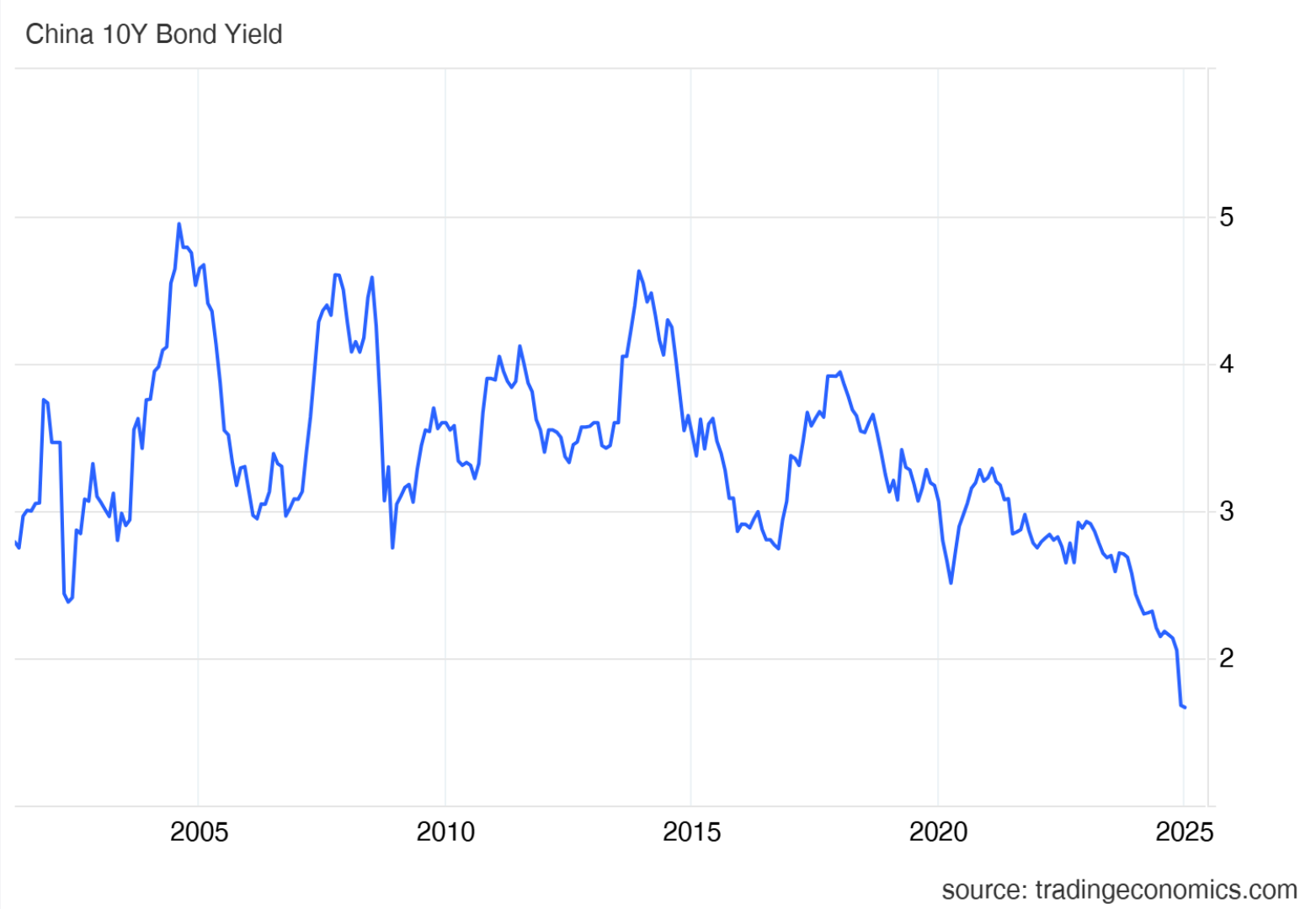
Chart #1: The Chinese Economy Remains In A Downtrend