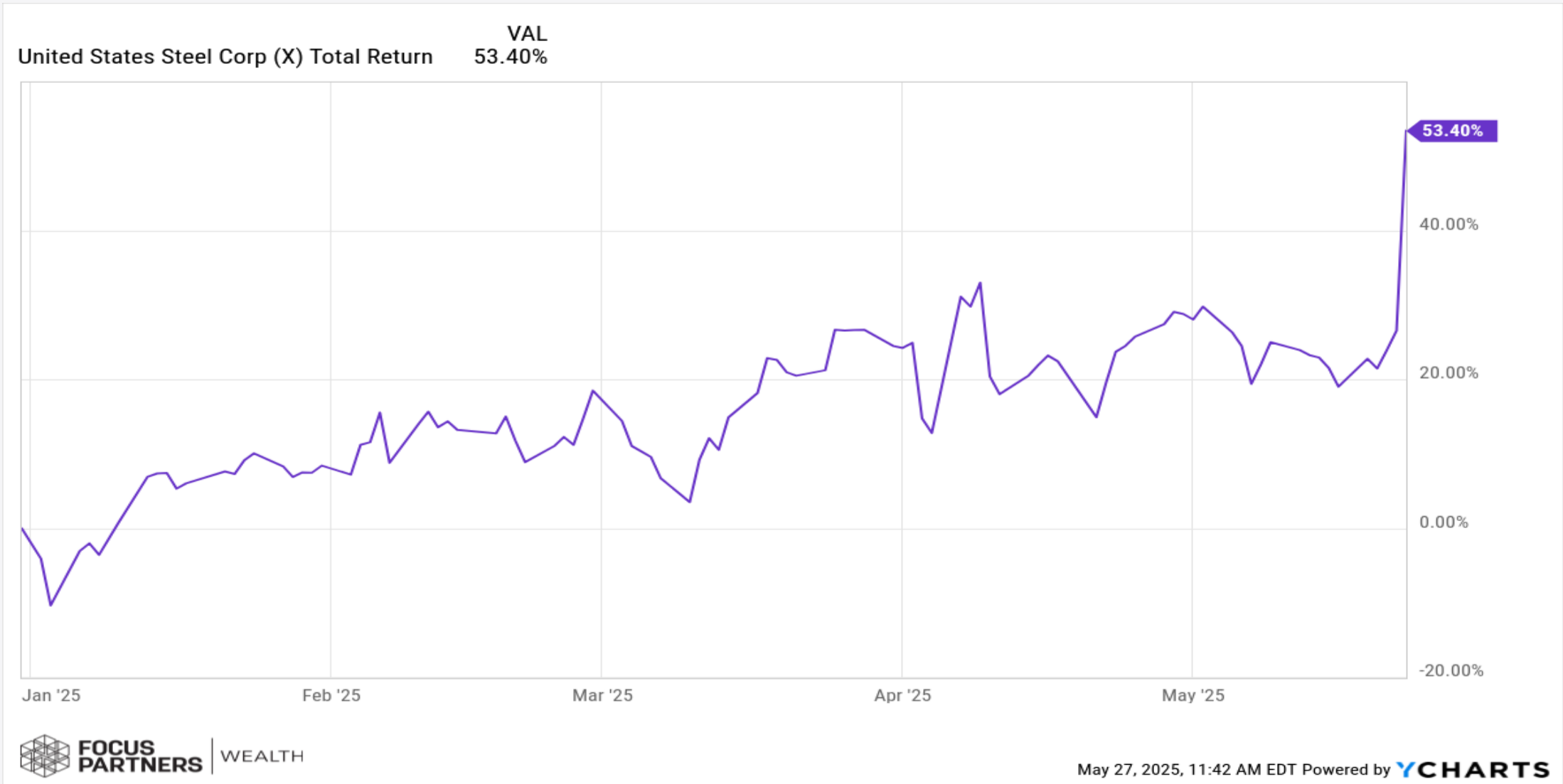
Chart #1: Deregulation Green Shoots