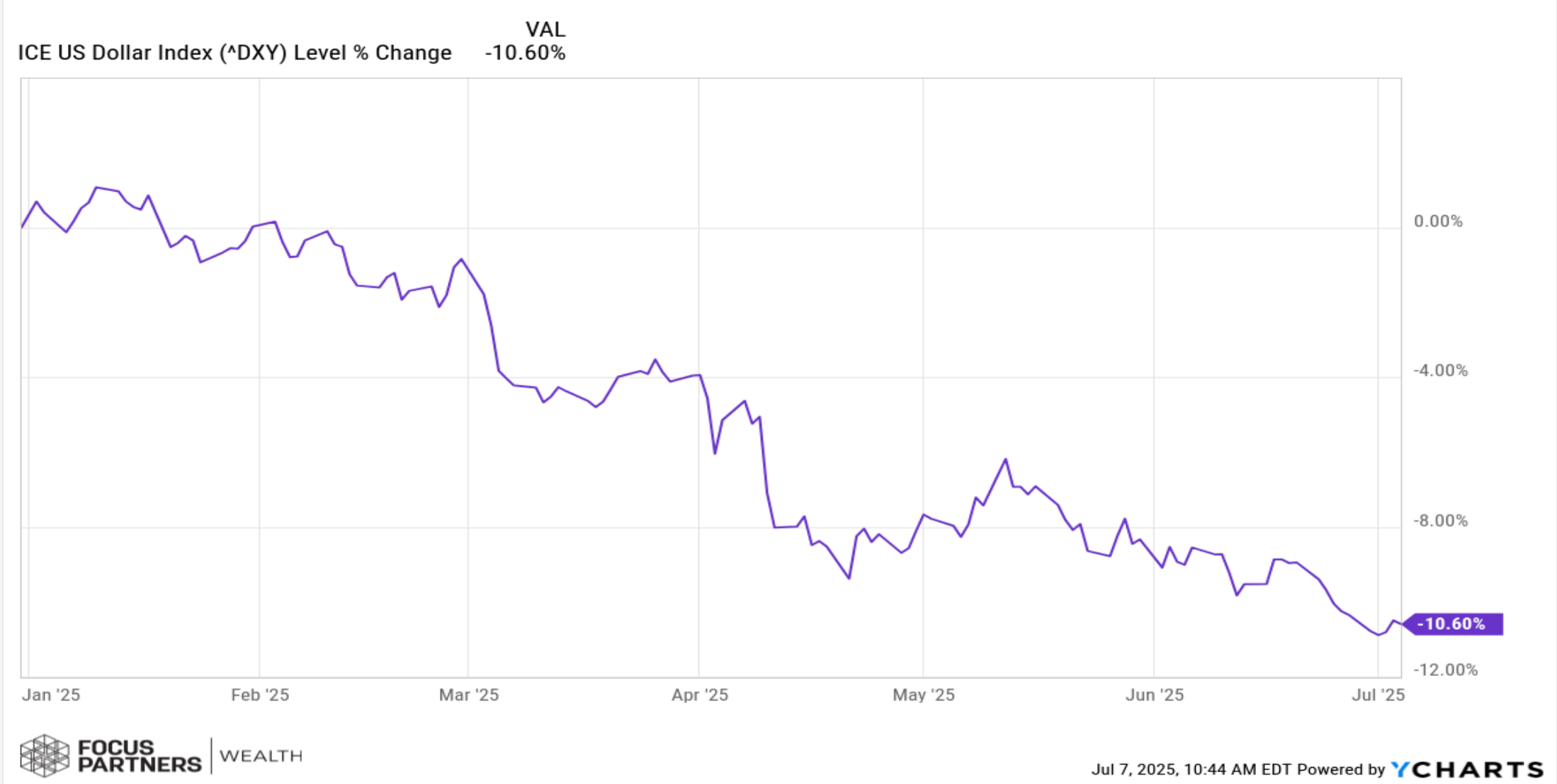
Chart #1: US Dollar YTD